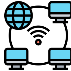
Network & telephone systems